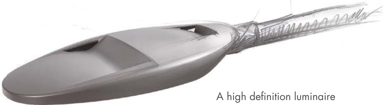
A high definition luminaire